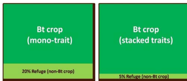
Trait stacking has simplified insect management for Bt crops by reducing the area requirement for refuge crop. This results in higher production gains from the use of biotech crops.

To prevent or delay the emergence of resistance to the Bt gene, many regulatory agencies require a refuge or an area planted to a non- Bt variety alongside the Bt crop. Typically a refuge is about 20 percent of the total crop area for a mono- Bt trait variety.